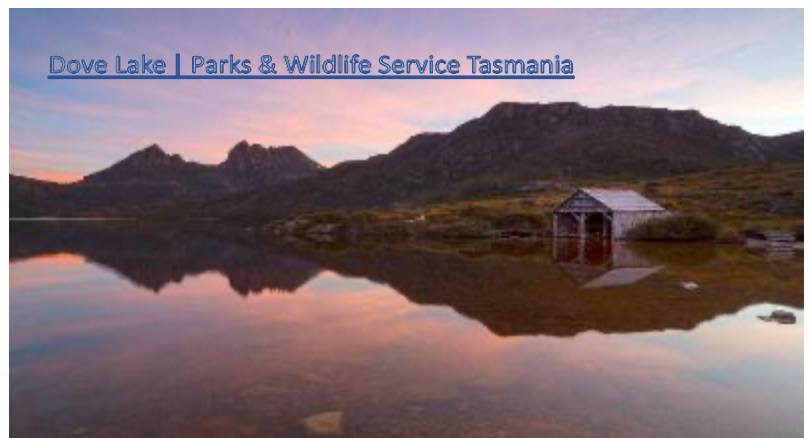
Dove Lake | Parks & Wildlife Service Tasmania

Tour amongst the wilderness and experience the awesome views across Dove Lake to the jagged dolerite peaks of Cradle Mtn.