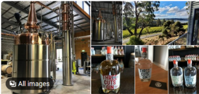
Turners Stillhouse Distillery welcome you to come try our award-winning Three Cuts Gin and Vodka (our whisky is patiently ageing) ideally located next to Tamar Ridge Cellar Door within the heart of the scenic Tamar Valley.

After lunch travel to Turners Stillhouse Distillery and Tamar Ridge Cellar -